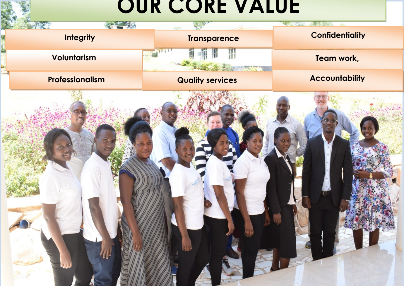
Group photo of MHOLA staffs with delegation from Better Way Foundation