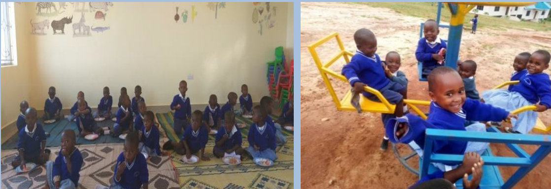
Photo 4: Children at MHOLA day care center enjoying their meals and playing grounds

Another important activity implemented was provision of Day care service at MHOLA Daycare Centre. About 40 (20 F, 20M) children from nearby areas of MHOLA Daycare Centre enjoyed the services. Mainly the services targeted to raise capacity of children to understand themselves and nature surrounding them, build their capacity to understand the rights and wrong and prepare them to join Pre- Primary Schools. This went along with renovation of playing grounds, experience is that school dropout has been reduced.