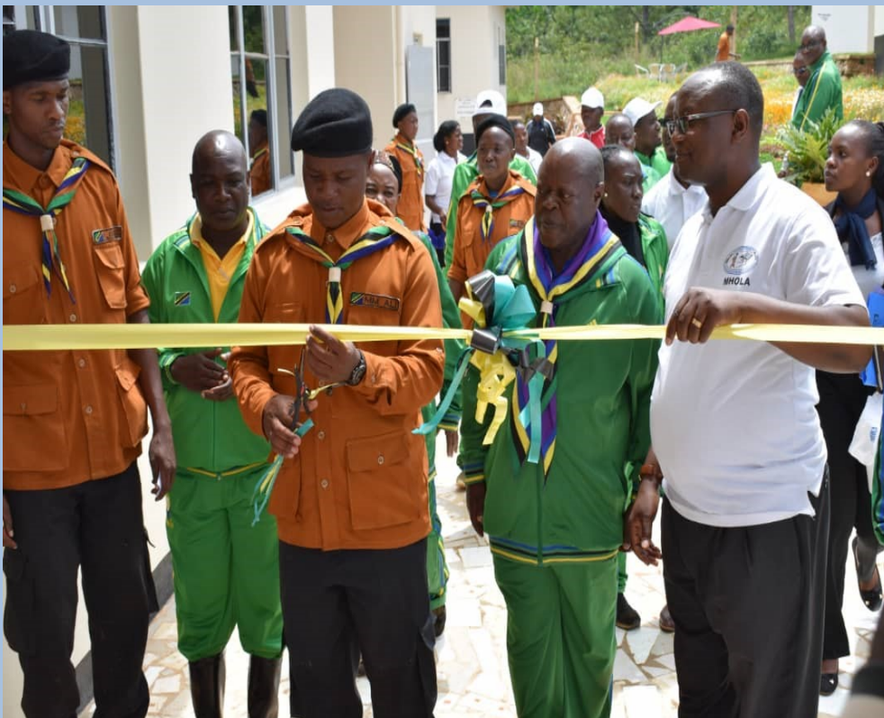
Photo 9: Chief Commander of 2019 Freedom Torch launching MHOLA daycare centre conference hall

Participation on National and Region Events: As reported earlier MHOLA received many invitations to participate, and such events were used as platform to introduce MHOLA's work. Events like National Torch commemoration, whereby through it MHOLA's conference hall was launched and Law Day week organized by Kagera Region Commissioner's office whereby MHOLA was a co- partner. Through this also exhibition was opted to some of events.