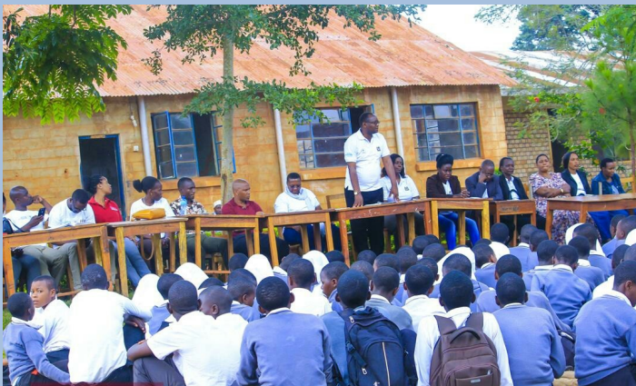
Photo 3: The 2019's Legal Aid Week Committee visited Kaigara School Club

Another opportunity assisted to accomplish the objective above was establishment of School Clubs to both regions of Kagera and Simiyu. These school clubs has been formed into 17 Schools (9- Simiyu) and 8 (Kagera). Approximately each School Clubs is formed by 100 students. This is to say 1,700 student has been reached. These Clubs are best forum to open up the mind of young girls and fellow young boys who sometimes act as perpetrators of SGBV. Through these clubs MHOLA and guardians teachers were exposed to nature of abuses facing girls. Also students were informed the causes, negative impact, role of each student (girl/boy) toward stopping SGBV.