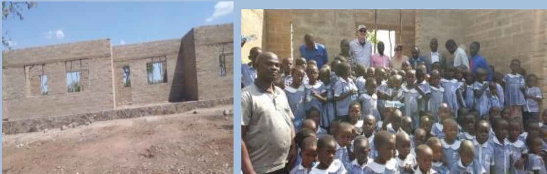
Photo 6: Current classroom used for program -on-going construction of classroom-more than 250 will benefit upon completion

Lastly but not least, Wellbeing day event in 2019 was implemented differently, the activity focused in improvement of wellbeing of the children in education sector since the early childhood program needs the conducive environment for learning. The organization under support of better way foundation managed to buy construction materials that used to build the ECD center at Rusese ward, Biharamulo district. The center will be able to serve more than 250 children living in that ward and nearby wards