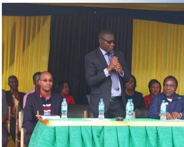
Photo 7: From left the first picture, Kagera's Regional Commissioner being provided with information from Muleba social worker when visited tent on legal aid week and last photo the deputy permanent secretary addressing the community members on legal aid week.